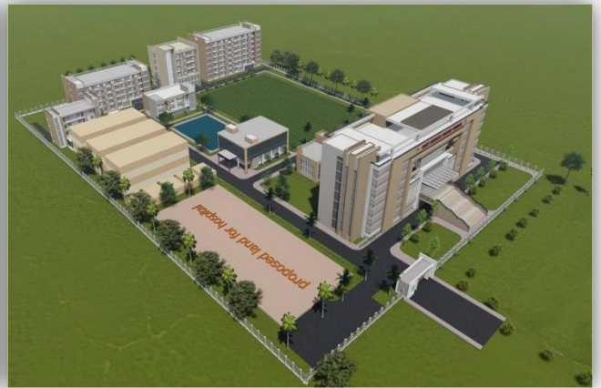
Army Medical College Cumilla