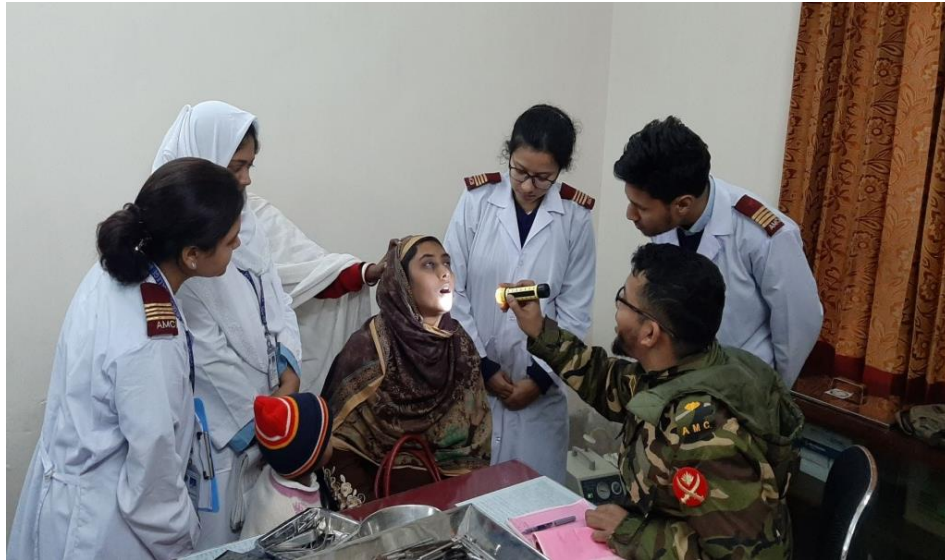
ENT Clinical Teaching

Department of ENT is responsible for teaching the students of 4th and 5th year MBBS course. Total allocation of teaching for the subject is 40 hours lecture and 8 weeks bedside teaching.