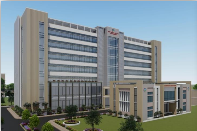
Army Medical College Chattogram