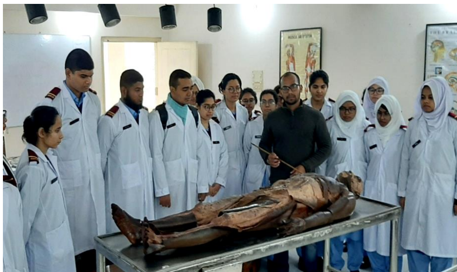
Anatomy Dissection Hall

Department of Anatomy is responsible for teaching pre-clinical cadets. The department teaches various disciplines of Anatomy namely Gross Anatomy, Embryology, Neuro Anatomy, Histology, Radiological Anatomy and Living Anatomy providing special emphasis on general, applied and functional aspects. Three academic terms cater for 530 hours out of which theoretical lecturers cover 115 hours and rest 415 hours are for practical, dissection and demonstration classes.