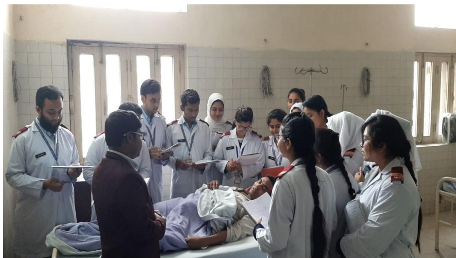
Surgery Clinical Teaching

Department of Surgery offers training to the medical cadets of 3rd, 4th and 5th years of MBBS course. The main objective of the department is to provide community-oriented and community need-based education so as to produce good young doctors who will be able to diagnose and manage the common surgical problems/emergencies prevalent in Bangladesh; undertake the responsibility of management of common casualties or natural calamities and identify the surgical problems requiring referral to the appropriate specialists. The allocation of teaching hours for the subject is 300 hours for theoretical lectures (Basic principles of surgery, Gastro-Intestinal surgery, Urology, Thoracic surgery, Neurosurgery, Cardiovascular surgery, Pediatric surgery, Organ transplantation surgery and the allied specialties-Anaesthesiology, Radiology & Imaging, Blood transfusion, Radiation oncology, Dental surgery, Physical medicine and Rehabilitation) Integrated Teaching Program for 20 hours and 3½ years (200 hours) of clinical practice in the affiliated teaching hospitals as well as the community-catchment areas as per syllabus.