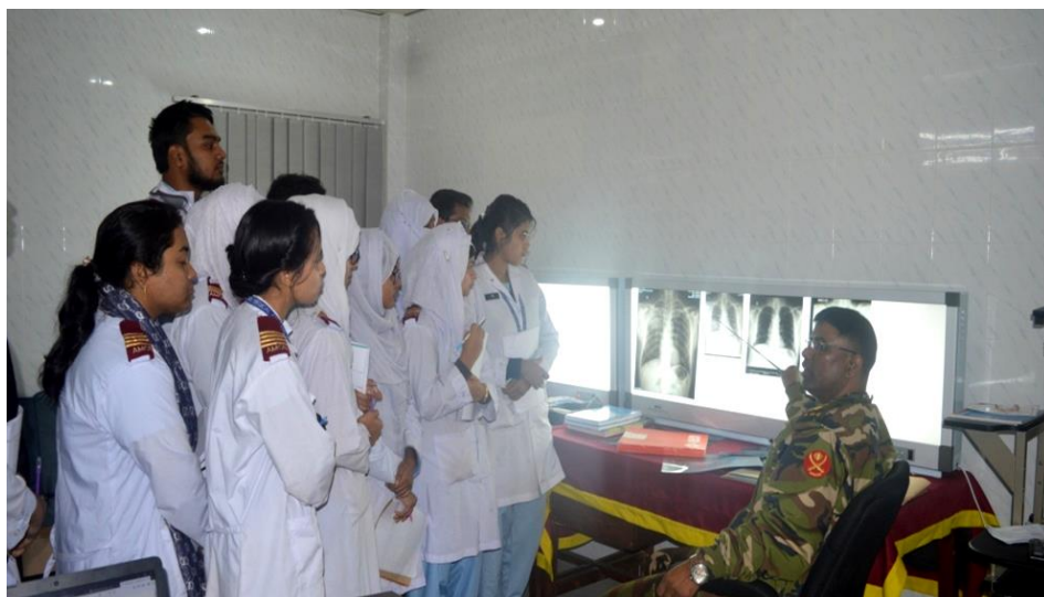
Radiology & Imaging Clinical Teaching

Department of Radiology & Imaging is responsible for teaching the students 5 hours lecture in 5th year and 1 weeks bedside teaching in 3rd year.