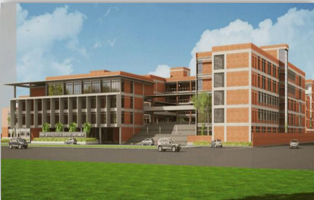
Army Medical College Jashore